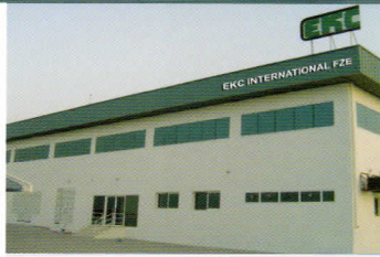
PLANT II, DUBAI