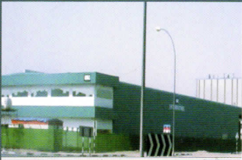
PLANT I, DUBAI